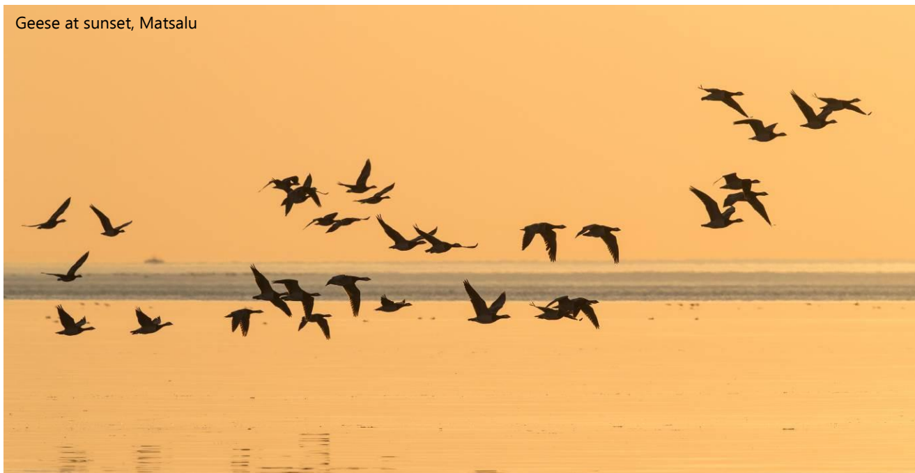
Geese at sunset, Matsalu

As many Naturetrek clients have already discovered, Estonia is an ideal spring destination for both birdwatchers and botanists offering a fascinating range of species amid unspoilt and picturesque scenery. Perhaps less well known are the many attractions of an autumn visit and this September holiday offers participants the opportunity to enjoy yet another facet of this remarkable country. At the end of the short Arctic summer, tens of thousands of birds begin their long southward migrations and Estonia is ideally positioned to offer a staging post for these migrants to pause and feed before continuing their extraordinary journey. The long, indented coastline provides a myriad of sheltered bays and marshes to attract waterbirds whilst passerines can find many leafy thickets to frequent on the long peninsulas that extend like fingers into the Baltic, or on the thousand or more islands that dot the coast. Whilst migration is always an unpredictable phenomenon, dictated by variations in weather conditions, the peak movements through Estonia are usually towards the end of September and our tour is timed to not only witness this veritable flood of birds but also to savour the vibrant colours of the autumn vegetation and of course the legendary Estonian hospitality which is such a feature of this friendly country.