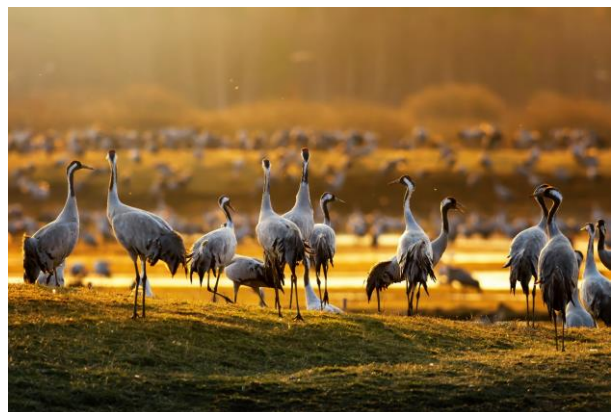
From top to bottom: Barnacle Geese, Lesser Spotted Eagle and Common Cran